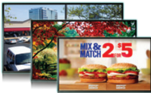
NL 12-18mm Bezel series