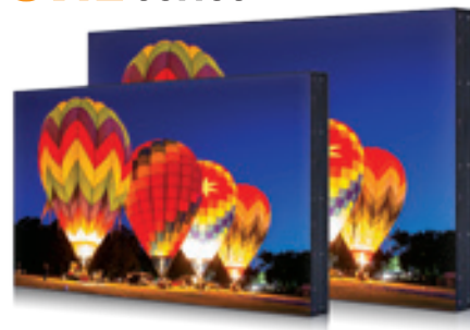
UNL 3mm Bezel series

UNL & NL video wall monitors display brilliant HD images across multiple monitors with nearly seamless gaps between the screens. Designed to work with the ViewZ PRO series video wall controllers and DSM series digital signage controllers.